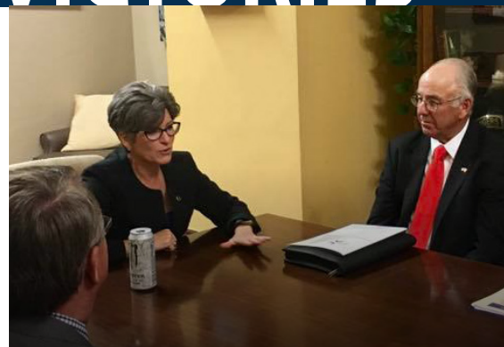
Pork producers lobbied congressional lawmakers on important pork industry issues. Above, Iowa producers talk with Sen. Joni Ernst, R-Iowa.

NPPC was the leading voice in opposition to the broader GIPSA Rule, generating in 2010 more than 16,000 comments from pork producers against it, and to the interim final rule. It